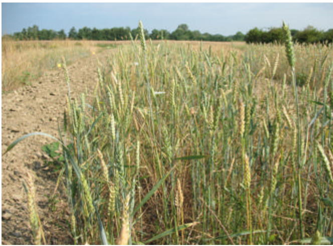
SSSUP wheat trials - Pisa (Italy)

WP4 is structured into four tasks. The first aims to design novel organic and low-input cropping systems based on optimum use of agrobiodiversity by simultaneously taking into account the genotype, environment and management components altogether. The hypothesis is that cropping systems based on higher genotype, species and/or management diversity would increase crop yield, yield stability, produce quality, soil fertility and weed suppression. Experiments will make use of genetically diverse germplasm (wheat, maize and tomato) developed by SOLIBAM partners. When