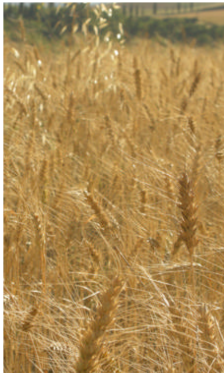
Wheat - evolutionary population (Italy)

A larger number of crops are included in comparisons of breeding strategies in winter wheat, barley, common bean, sprouting broccoli, cabbage, maize and tomato. Led by ORC, the trials compare genotypes representing different breeding strategies (populations, mixtures, landraces and pedigree lines) in varied geographical locations in Europe and sub-Saharan Africa. A major assumption to be tested is that reliability will be correlated with increased within-crop diversity. Trials started in 2010 and will continue through to project year 4.