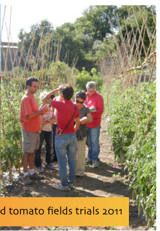
Italy - wheat and tomato fields trials 2011