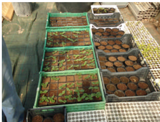
Tomato seedlings tested in Italy in WP3

from those of producers selling to large retailers. For vegetables, the impact of nurseries is considered as a major factor, and this issue needs more investigations. The final analysis of this work is expected in late 2012.