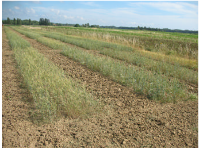
SSSUP wheat trials - Pisa (Italy)

sustainability of the systems. A common set of parameters will be measured across all experiments to ensure homogeneous evaluation of cropping system effects on key traits. Data and samples collected in WP4 experiments will feed the global performance analysis of highly diverse germplasm (WP1), the analysis of produce quality (WP7) and the sustainability analysis (WP8).