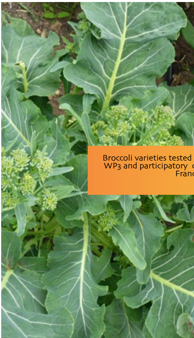
Broccoli varieties tested in France and Italy in WP3 and participatory quality assessment in France