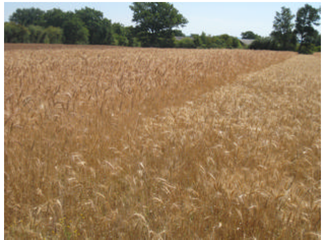
Old wheat varieties trials - France

results will also provide hints on which types of structure and management of non cropped areas (e.g. flora composition, habitat complexity, mowing and/or cultivation of field margins) are more likely to enhance these agroecosystem services.