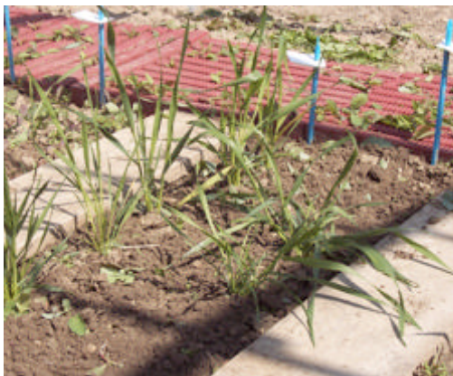
Wheat seedlings - INRA Le Moulon (France)

In Task 2.3, multivariate approaches to selection responses and methods for association studies in breeding populations will be developed. Based on the insights obtained on the genetic and epigenetic mechanisms involved in adaptation to organic and LI farming, appropriate strategies incorporating marker assisted selection (MAS) at different levels will be proposed. Multivariate approaches will be used to assess the selection strength of various traits under different conditions and to predict selection responses. The results obtained on the molecular diversity of all populations will be discussed during a common meeting at month M40 with all the partners that have been involved in the development of the populations in other WPs (e.g. WP3 and WP5) and also including the partners who are not directly involved in WP2.