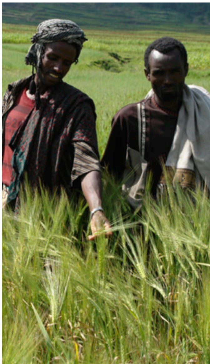
On the left: Farmers discussing barley attributes during field selection day