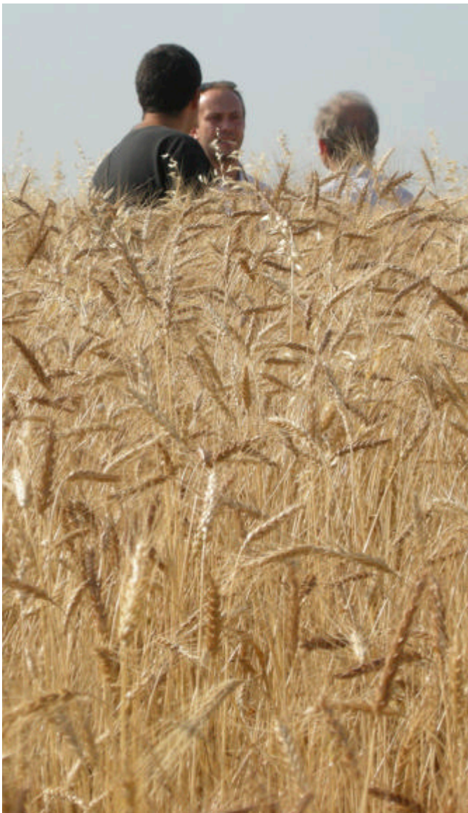
Farm days in Italy in June 2001. In the left Castellaneta (Puglia), in the right Isernia (Molise).

initiated under different environments and management conditions in order to study their effects and interactions. The performance and yield stability of the existing varieties of bread wheat and durum wheat grown under organic and conventional systems was studied using ring tests in three different countries, and detailed studies on the resistance against common bunt were carried out. According to the time schedule the majority of the experiments are at the initial phase of development, but the first selection steps have been successfully completed. Based on the results from these existing varieties, the development of organic maintenance breeding methods has been initiated, and tests of the effect of post harvest methods for organic seed production were carried out to examine the whole process of organic variety production.